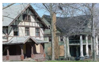
Solutions to Abandonment

NVPC has helped other cities such as Buffalo and Cleveland